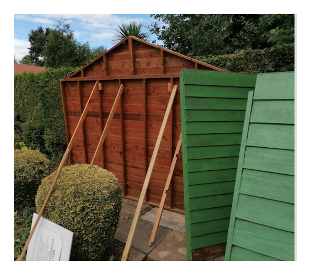
Reconstruction of new gardening shed