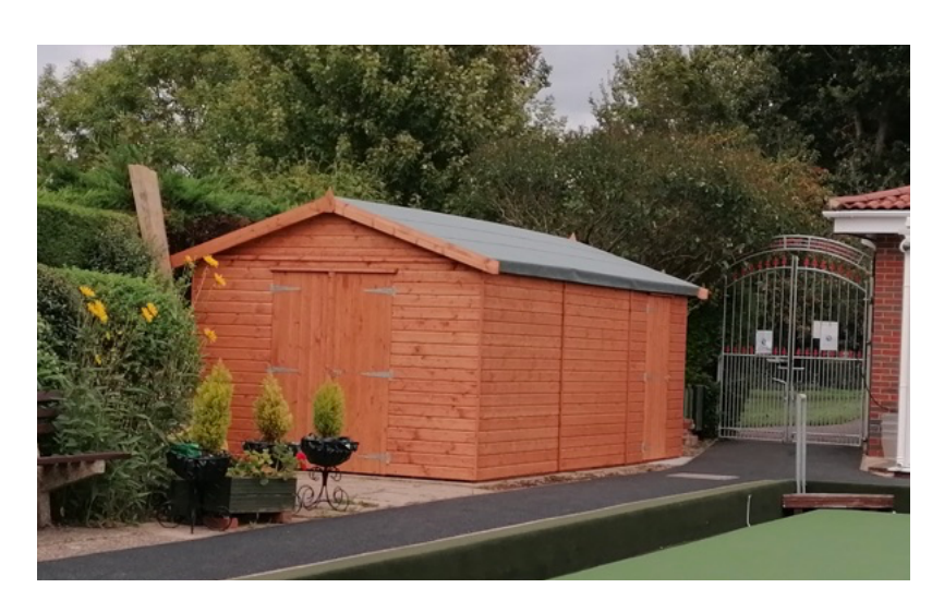
New shed completed 7<sup>th</sup> September 2020

On behalf of the club, we would like to thank all those who have helped in the planning, dismantling and rebuilding of this project.